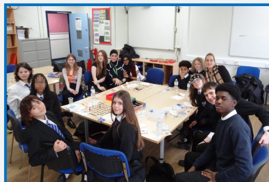
Enjoying pizza and games with my Headteacher Award winners from last term