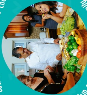
Fun activities for the whole family