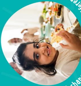
Small changes that make a big difference