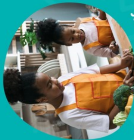
Healthy eating tips