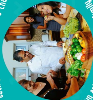
Fun activities for the whole family