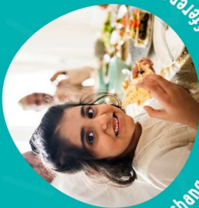
Small changes that make a big difference