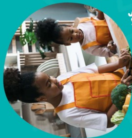
Healthy eating tips